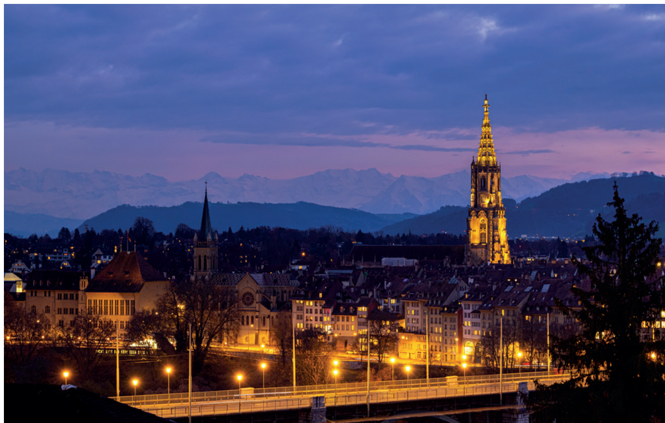
The Kursaal Bern offers a breathtaking view of the City of Bern and the Alps.

The participant acknowledges that they have no rights to lodge damage claims against the organizers, should the holding of the meeting be hindered or prevented by unexpected political or economic events, pandemic or generally by force majeure, or should the non-appearance of speakers or other reasons necessitate program changes. Participants take part in all events of this meeting at their own risk. With the registration, the participant accepts this proviso.